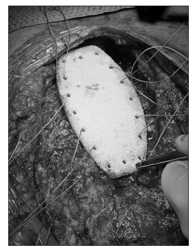
Figure 1: Anchored prosthesis with sutures

We propose a new material for thoracic wall reconstruction and particularly for sternum. Several drawbacks have been reported for biomaterials used in chest wall reconstruction over the past 30 years:<sup>[2]</sup> erosion of adjacent structures, rupture and migration, infection, or immunological reaction. During the past 5 years, custom-made titanium sternal implants, sternal allografts, and mesh have been associated with advantages over other materials. Nonetheless, all requirements of the ideal sternal replacement