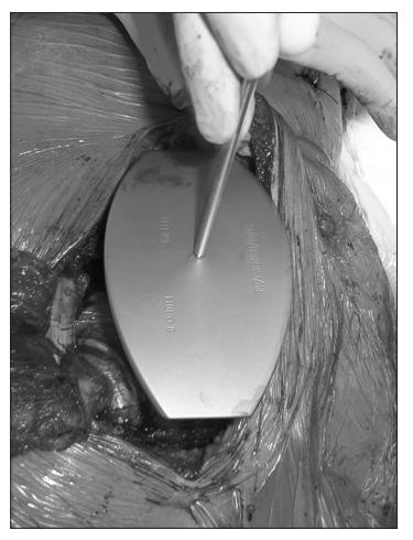
Figure 2: Testing metallic implant